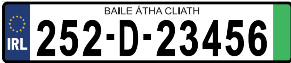
Diagram No. 5

“2B. The identification mark of an eligible vehicle may be displayed on a rectangular plate which shall correspond with either Diagram No. 5 or Diagram No. 6 shown below: