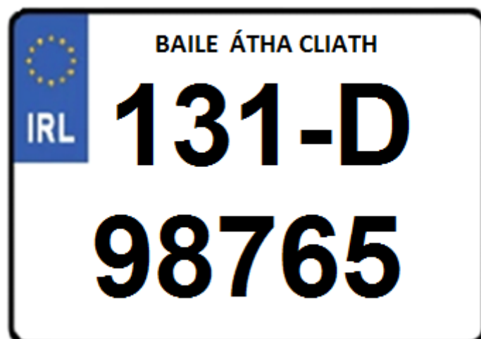
Diagram No. 4”,