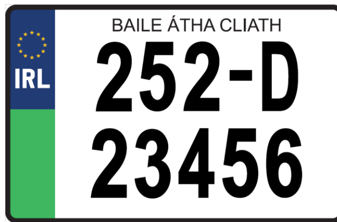
Diagram No. 6”,