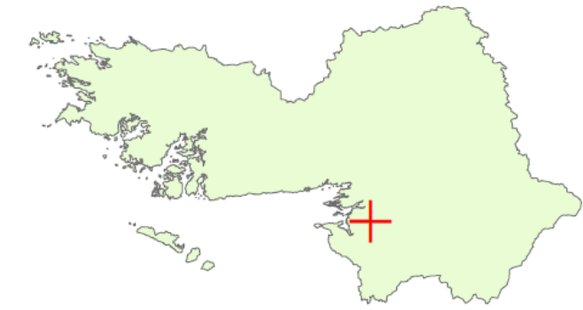
Co. na Gaillimhe Co. Galway