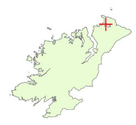
Co. Dhún na nGall Co. Donegal