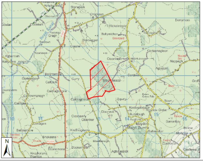
Córas Comhordanáidí: Trasteilgean Mercator na hÉireann / Co-ordinate System: Irish Transverse Mercator