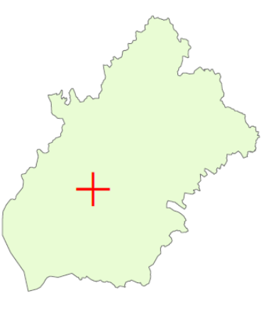
Co. an Longfoirt Co. Longford