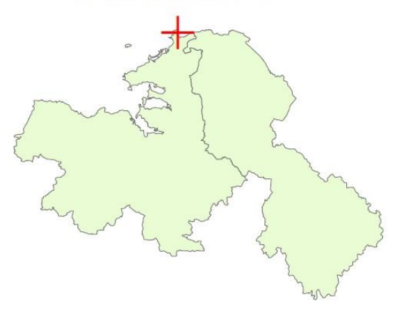
Co. Liatroma agus Co. Shligigh Co. Leitrim and Co. Sligo