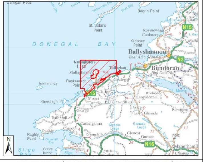
Córas Combordanáidí: Trasteilgean Mercator na hÉireann / Coordinate System: Irich Transverse Mercator