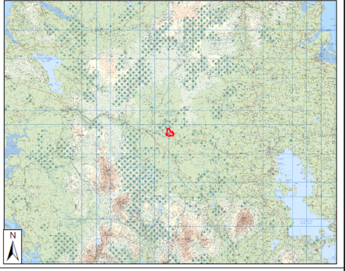
Suirbhéireacht Ordanáis Éireann Ceadúnas Uimhir OSI-NMA-014 Ordnance Survey Ireland Licence No. OSI-NMA-014 Córas Comhordanáidí: Trasteilgean Mercator na hÉireann / Co-ordinate System: Irish Transverse Mercator