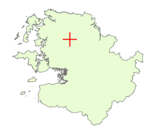
Co. Mhaigh Eo Co. Mayo