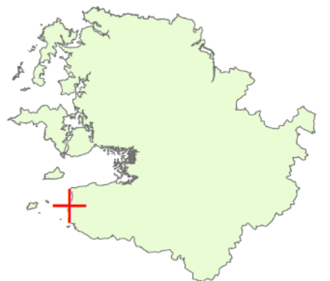
Co. Mhaigh Eo Co. Mayo