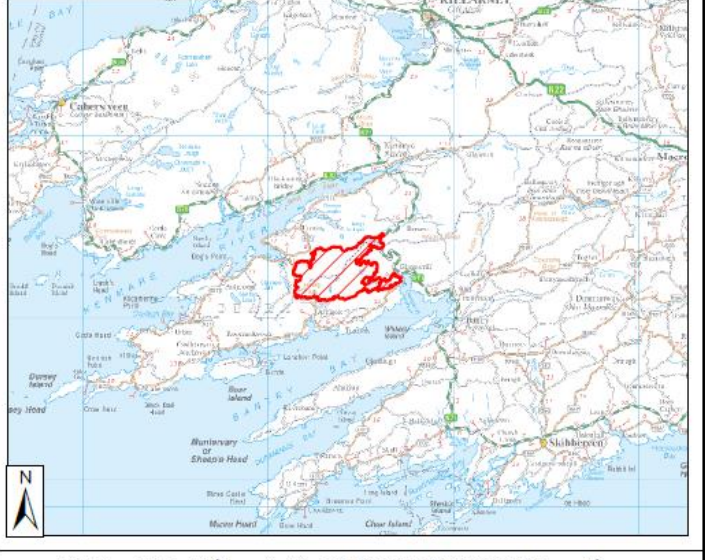
Suirbhéireacht Ordanáis Éireann Ceadúnas Uimhir OSI-NMA-014 Ordnance Survey Ireland Licence No. OSI-NMA-014 Córas Comhordanáidí: Trasteilgean Mercator na hÉireann / Co-ordinate System: Irish Transverse Mercator