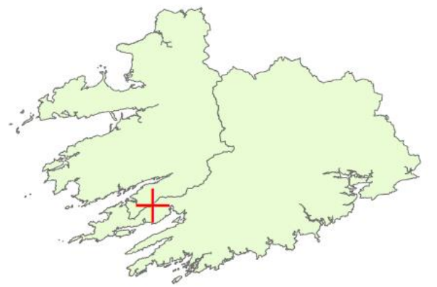
Co. Chorcaí Agus Co. Chiarraí Co. Cork And Co. Kerry