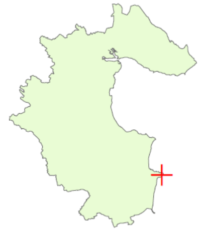
Co. Lú Co. Louth

LCS Cheann Chlochair Clogher Head SAC 001459 Achar / Area 23.10 ha