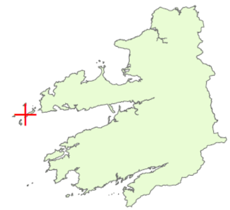
Co. Chiarraí Co. Kerry