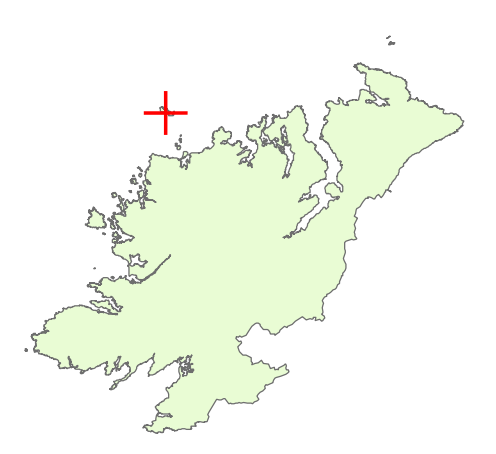
Co. Dhún na nGall / Co. Donegal