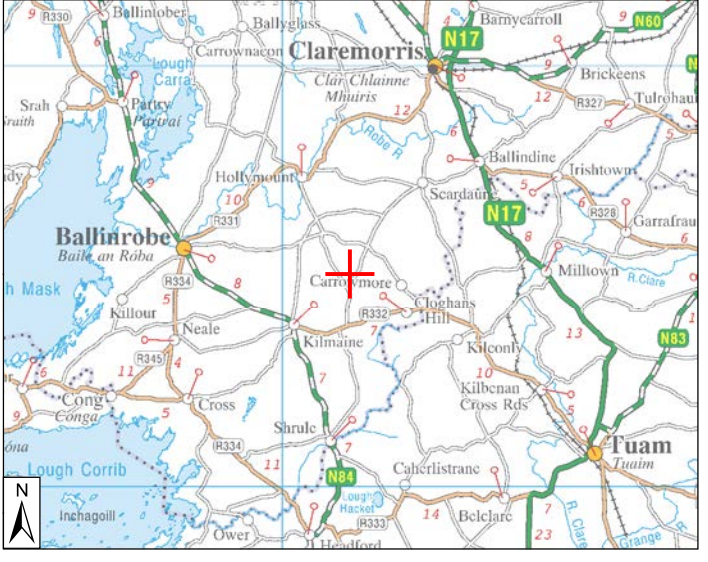
Suirbhéireacht Ordanáis Éireann Ceadúnas Uimhir EN 0059216 © OSi / Rialtas na hÉirean Suironeireacht Orannais Eireann Cadaunas Unini EN W099216 © USI/ Naidas na nEireann Ordnance Survey Ireland Licence No. EN 0059216 © Ordnance Survey Ireland / Government of Ireland Córas Comhordanáidí: Trasteilgean Mercator na hÉireann / Co-ordinate System: Irish Transverse Mercator