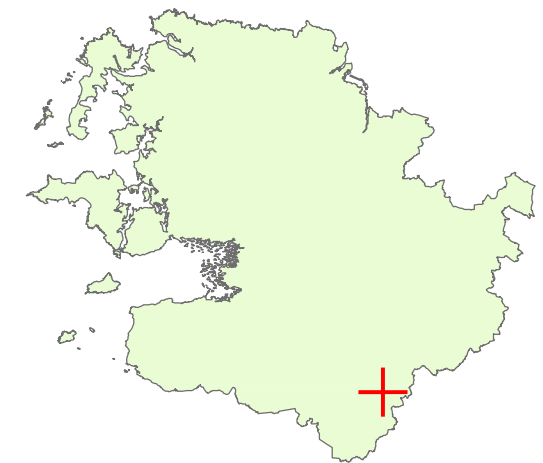
Co. Mhaigh Eo Co. Mayo