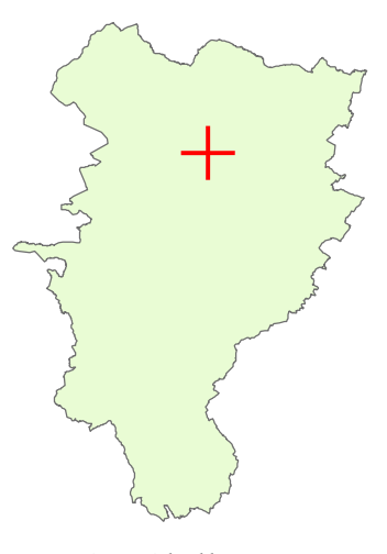
Co. Chill Dara Co. Kildare