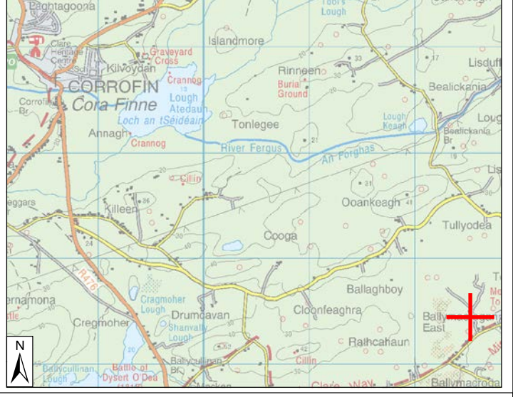
Suirbhéireacht Ordanáis Éireann Ceadúnas Uimhir EN 0059216 © OSi / Rialtas na hÉireann Ordnance Survey Ireland Licence No. EN 0059216 © Ordnance Survey Ireland / Government of Ireland Córas Comhordanáidí: Trasteilgean Mercator na hÉireann / Co-ordinate System: Irish Transverse Mercator