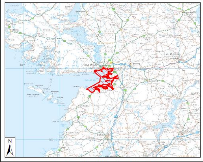
Suirbhéireacht Ordanáis Éireann Ceadúnas Uimhir OSI-NMA-014 Ordnance Survey Ireland Licence No. OSI-NMA-014 Córas Comhordanáidí: Trasteilgean Mercator na hÉireann / Co-ordinate System: Irish Transverse Mercator