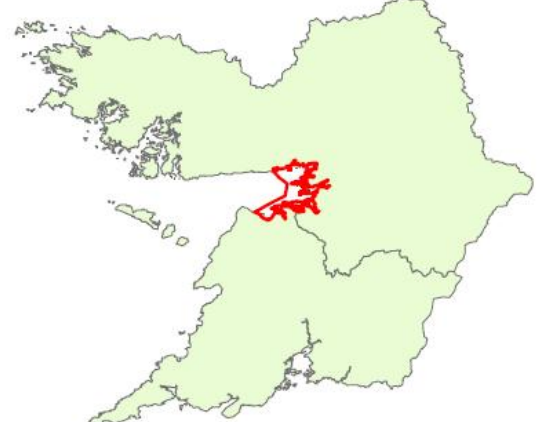
Co. an Chláir agus Co. na Gaillimhe Co. Clare and Co. Galway