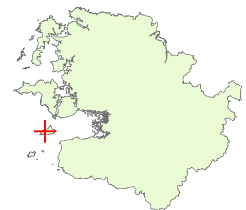
Co. Mhaigh Eo / Co. Mayo