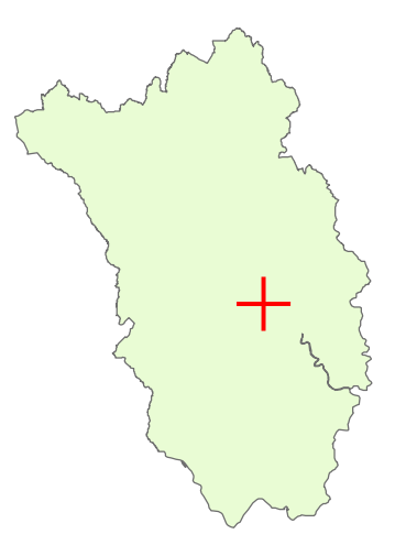
Co. Chill Chainnigh Co. Kilkenny