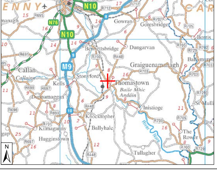
Suirbhéireacht Ordanáis Éireann Ceadúnas Uimhir EN 0059216 Ordnance Survey Ireland Licence No. EN 0059216 Córas Comhordanáidí: Trasteilgean Mercator na hÉireann / Co-ordinate System: Irish Transverse Mercator