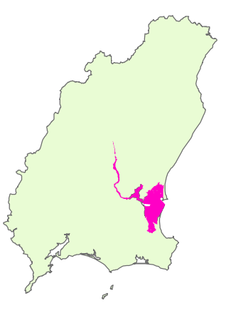
CO. WEXFORD CO. LOCH GARMAN