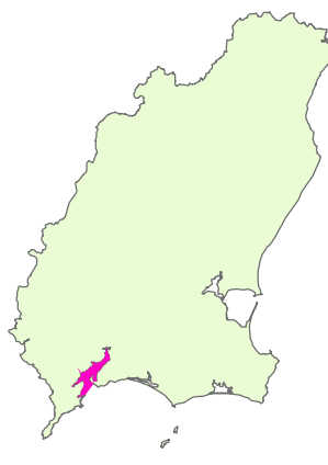
CO. WEXFORD CO. LOCH GARMAN