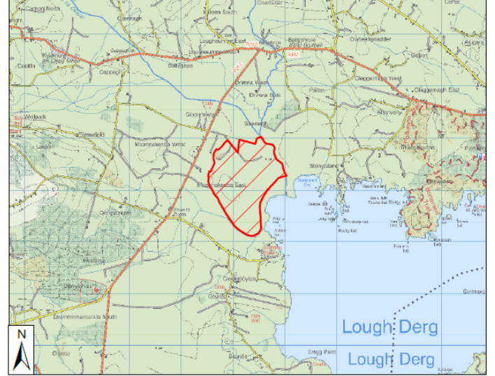
Suirbhéireacht Ordanáis Éireann Ceadúnas Uimhir OSI-NMA-014 Ordnance Survey Ireland Licence No. OSI-NMA-014 Córas Comhordanáidí: Trasteilgean Mercator na hÉireann / Co-ordinate System: Irish Transverse Mercator