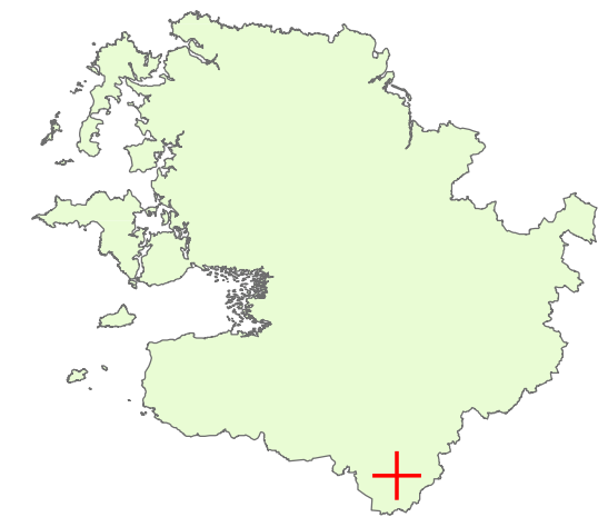
Co. Mhaigh Eo Co. Mayo