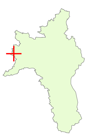
Co. Ros Comáin Co. Roscommon