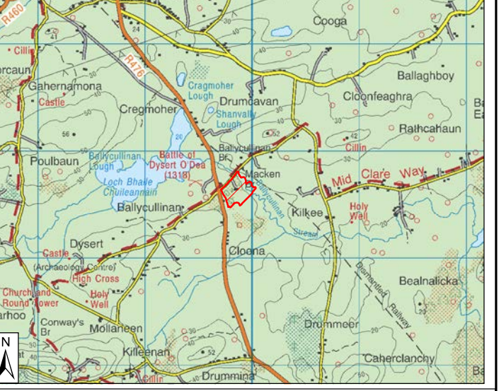
Suirbhéireacht Ordanáis Éireann Ceadúnas Uimhir EN 0059214 Ordnance Survey Ireland Licence No. EN 0059214 Córas Comhordanáidí: Trasteilgean Mercator na hÉireann / Co-ordinate System: Irish Transverse Mercator