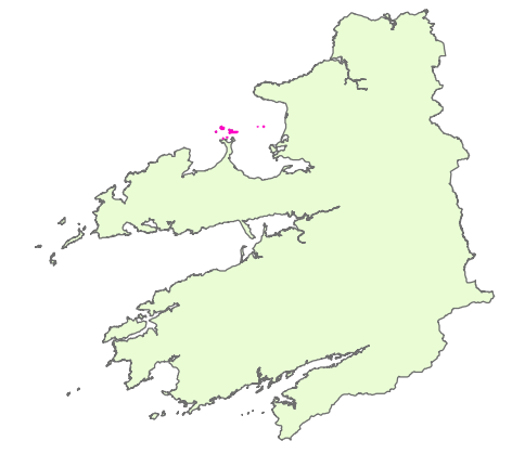
CO. KERRY CO. CHIARRAÍ