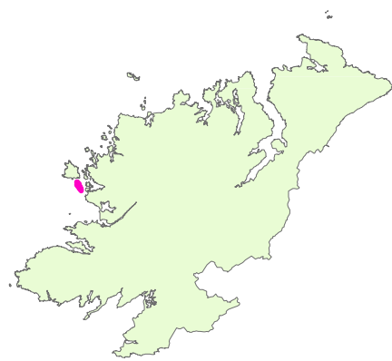
CO. DONEGAL CO. DHÚN NA NGALL