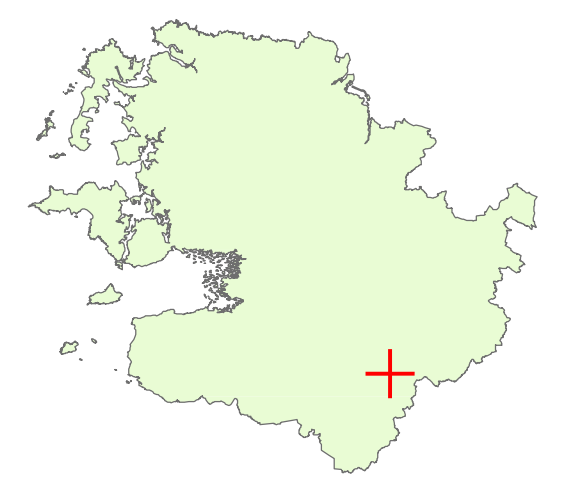
Co. Mhaigh Eo Co. Mayo