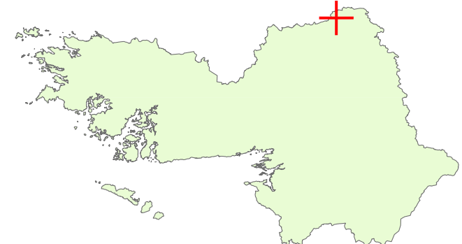
Co. na Gaillimhe Co. Galway