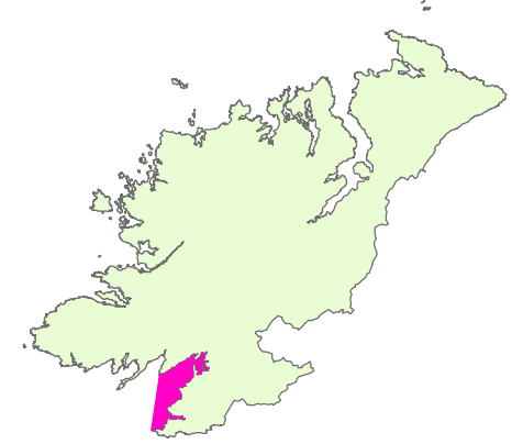
CO. DHÚN NA NGALL