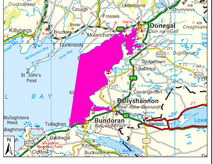
Printed on: 30/11/2010