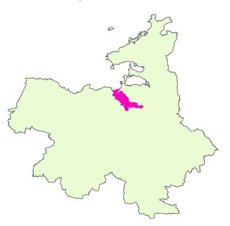
CO. SLIGO CO. SHLIGIGH