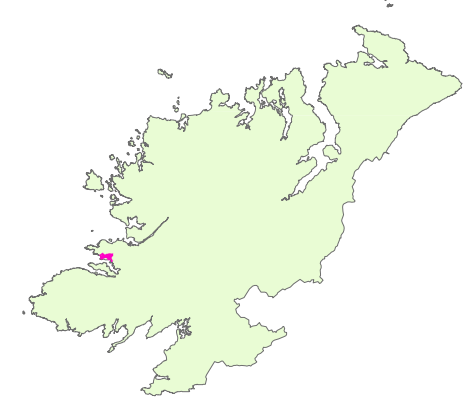
CO. DONEGAL CO. DHÚN NA NGALL